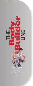
MODEL 1304 SHOWN