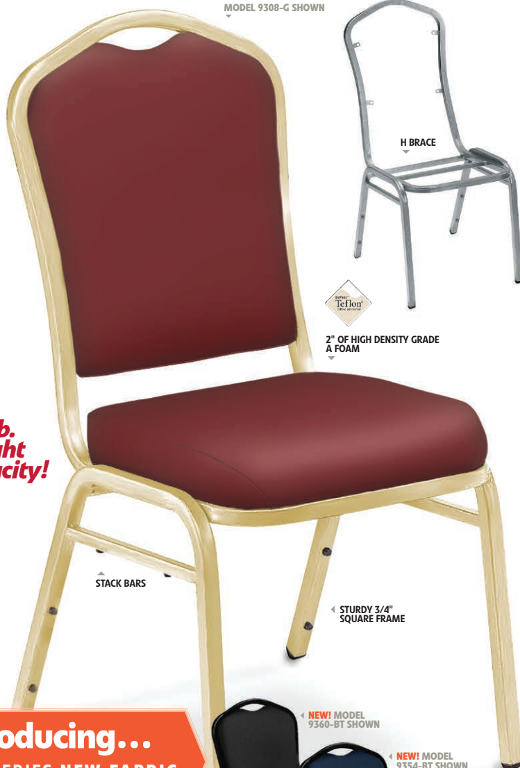
MODEL 9308-G SHOWN

products meet or exceed applicable ANSI/BIFMA standards