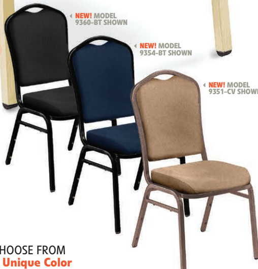
NEW! MODEL 9360-BT SHOWN