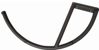
Left Base (D) Qty:1