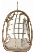
Basket (A) Qty:1