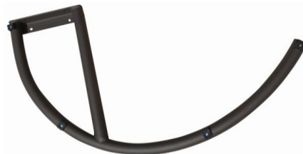
Right Base (E) Qty:1