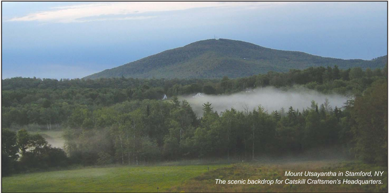
Mount Utsayantha in Stamford, NY The scenic backdrop for Catskill Craftsmen's Headquarters.

With forests blanketing over 75% of the Catskills Region, Catskill Craftsmen supports the Watershed Agricultural Council's focus on educating and demonstrating the role of forests in protecting watersheds. Through forest stewardship planning, research, and using voluntary practices to limit non-point source pollution. These partnerships encourage a healthy watershed while improving economic conditions for rural communities within the Catskills Region. To learn more about our watershed, visit www.nycwatershed.org .